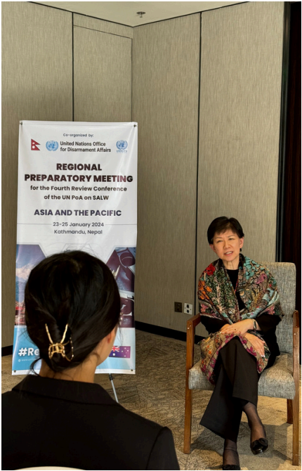
Interviewing Ms. Izumi Nakamitsu, Under-Secretary-General and High Representative for Disarmament Affairs