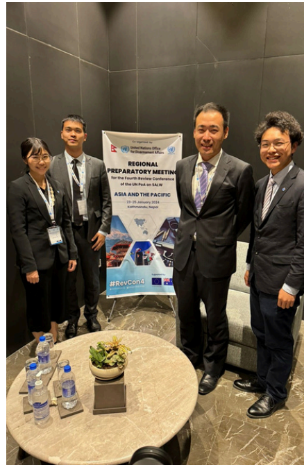
Interviewing Chinese Delegations about SALW control