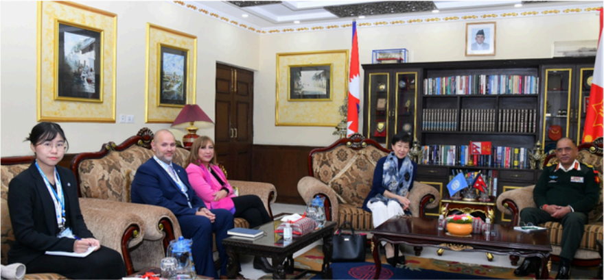
Visiting Chief of the Army Staff of the Nepal Army