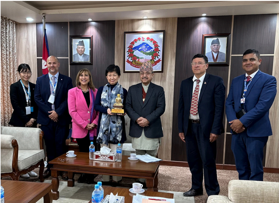
Visiting The Ministry of Defence of Nepal